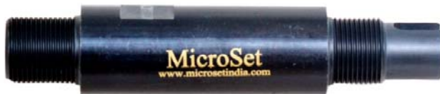
DO Electrode Assembly 3/4" BSP (M) Connection